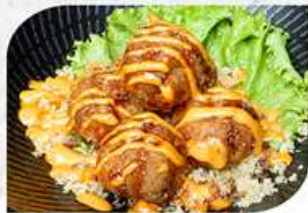
クリームチーズサーモンコロッケ CREAM CHEESE SALMON CROQUETTE deep-fried salmon croquettes with cream cheese