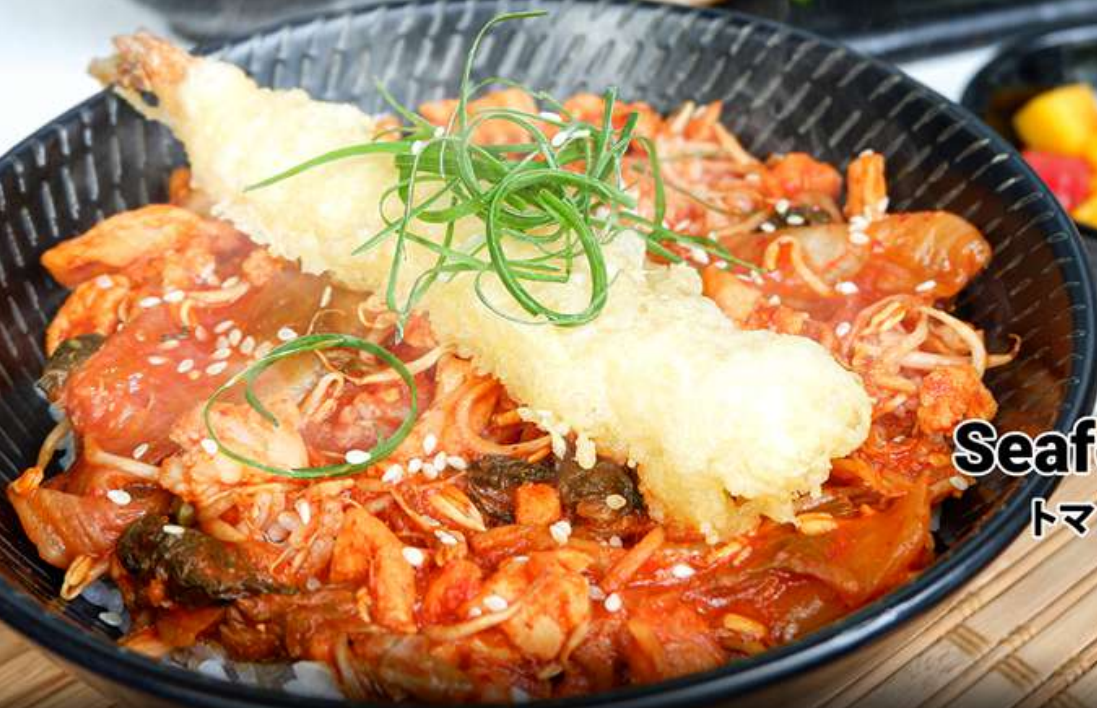
Tomato Seafood Don トマトシーフード丼

COMES WITH RICE BOWL, SOUP, GYOZA, SIDE SALAD