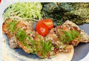
CRISPY CHASHU NORI WITH CREAM CHEESE fried pork slices and nori with cream cheese sauce